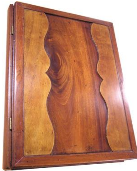
Figure 1: The Zimmerman Book

The debate between cultural custodian and improved delivery on user expectations is current. This project will form the first of many endeavours to open up access to our rare material. Whilst digitization does not yet transverse issues of preservation, its increased prominence will facilitate increased use, new avenues of research and new users. (Hirtle 2002). The thrust will be to expose that which truly is unique to the widest audience and to encapsulate and encourage new scholarly pursuits via this dissemination. However the question about digital technology as an adjunct to rare physical resources, or its long term replacement, remains unanswered. (Smith 1999)